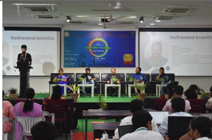
Photographs of the event (Hard copy and Soft copy)

PO6: An ability to understand the impact of the professional engineering solutions in societal and environmental contexts and strives for sustainable development.